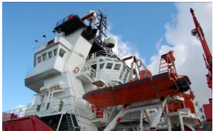
Rescue-, 1st line Oil Rec- and A/H winch area